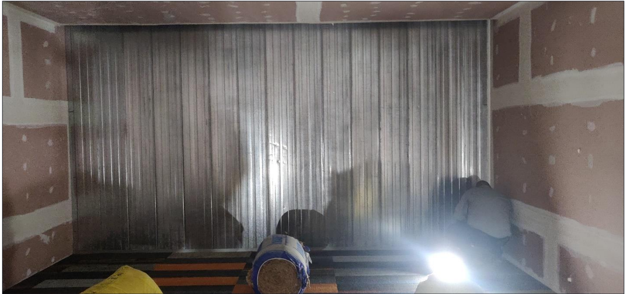
Figure 4: Wall panel system test sample