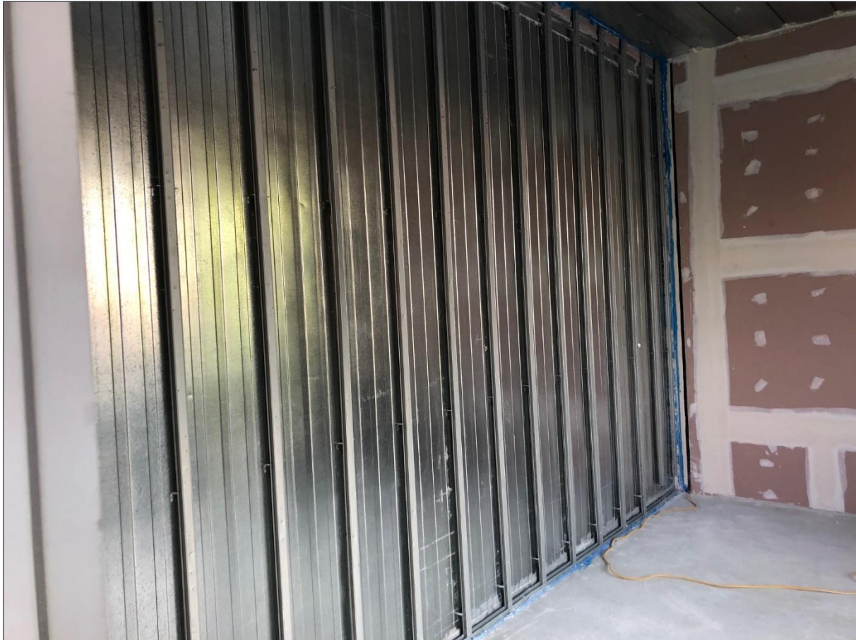
Figure 4: Source room side of wall