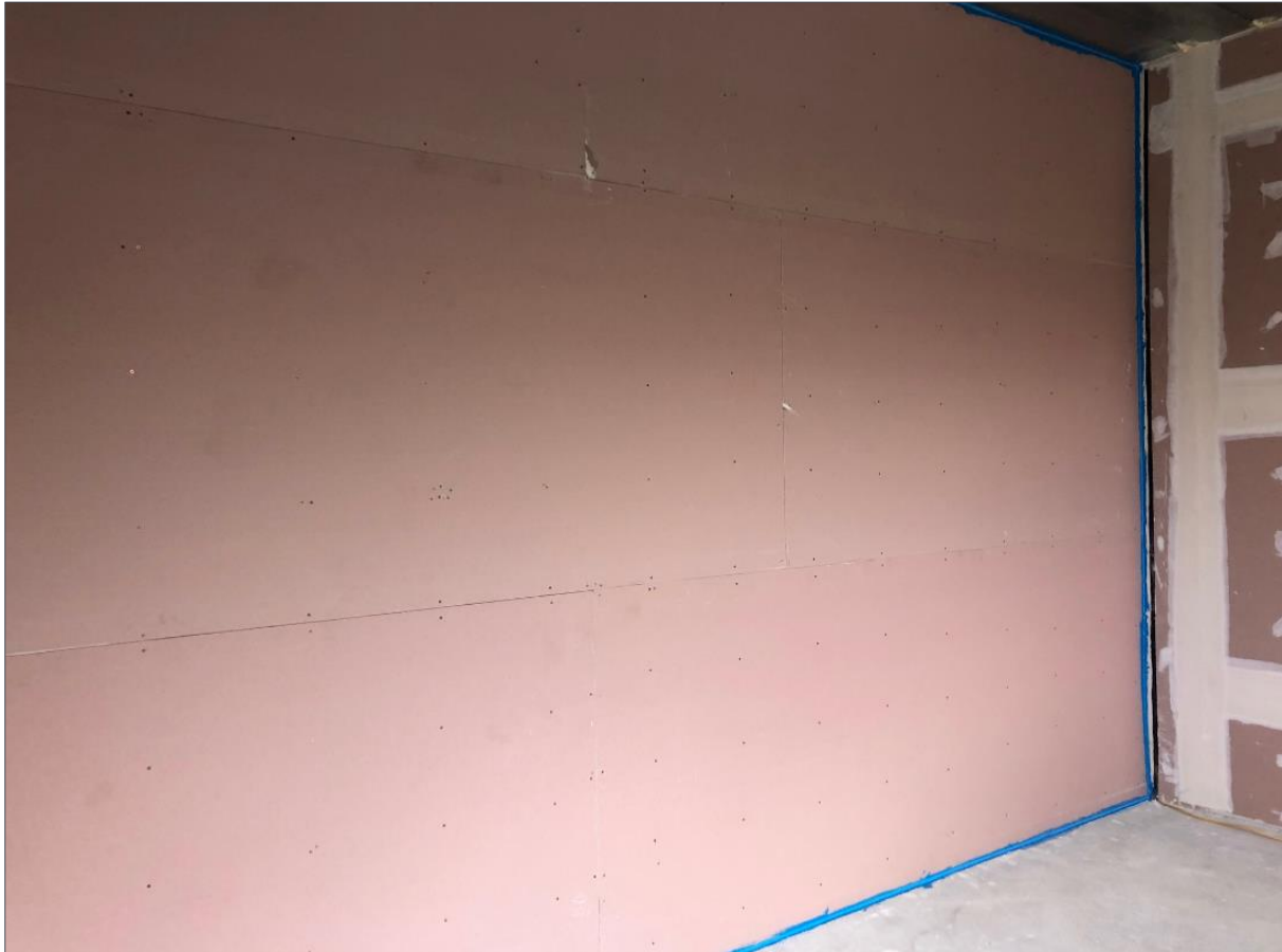
Figure 4: Source room side of wall