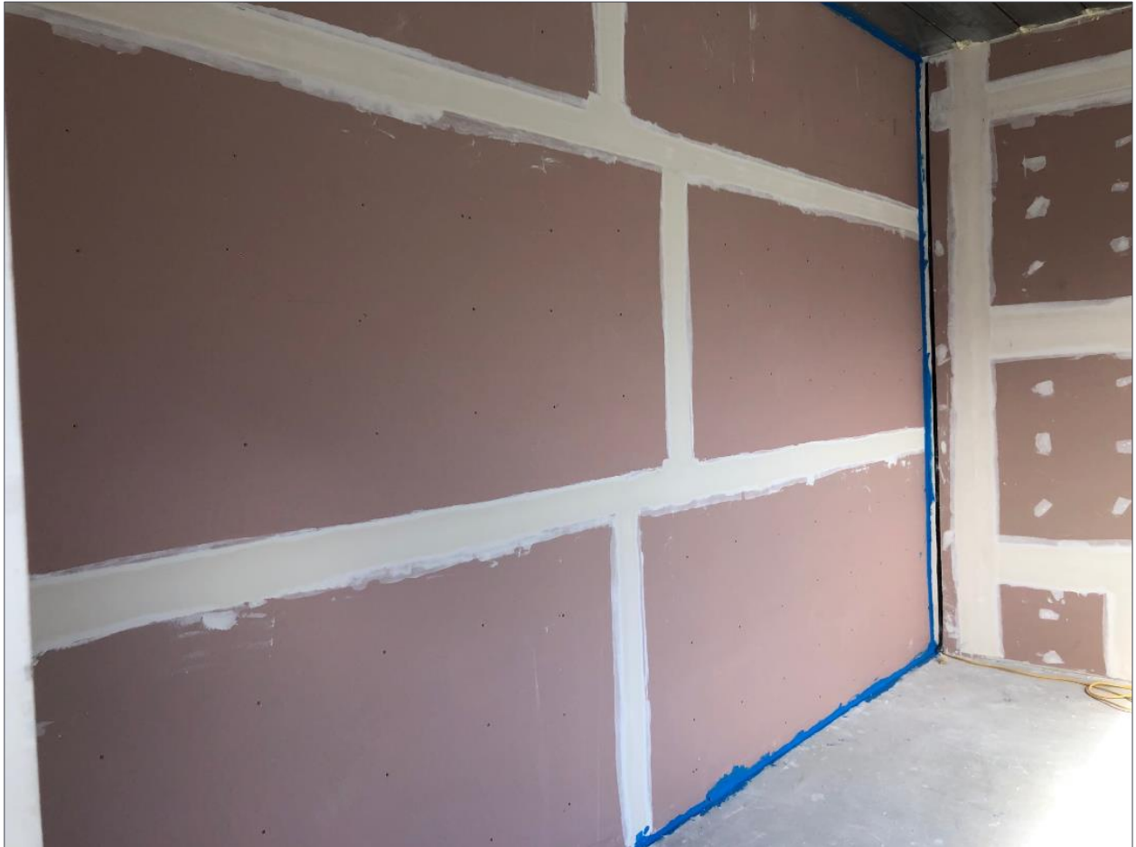
Figure 4: Source room side of wall