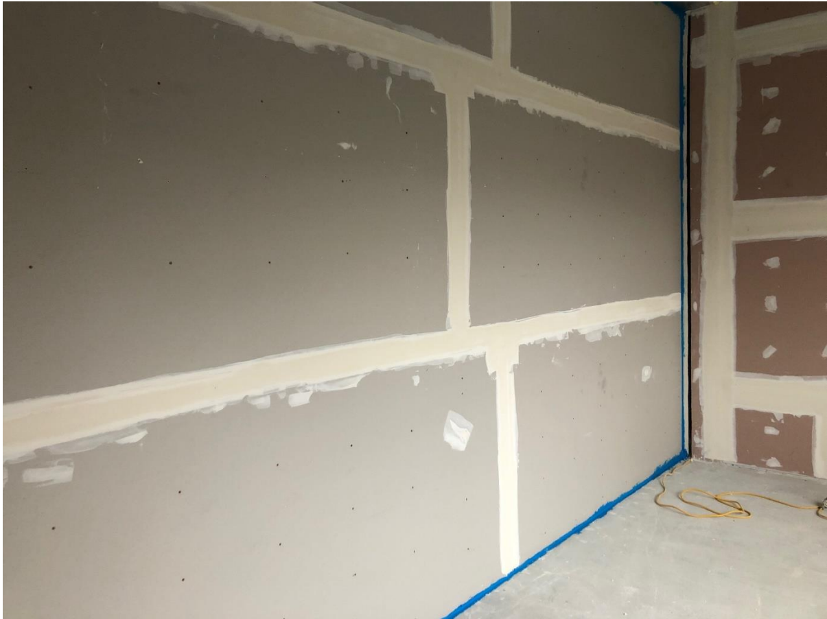
Figure 4: Source room side of wall